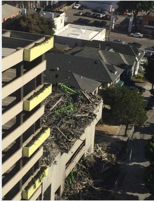
From left: Construction site on June 21st, and on July 17th.