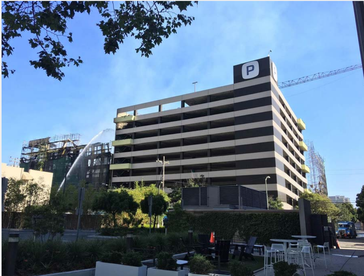
View from patio of the Oakland office. The parking garage is where several PRC staff park.

Early morning (4:30 AM PST) on July 7th, there was a four-alarm fire at a construction site near the PRC office in Oakland. The building was closed that day given the firefighting activities nearby. No injuries were reported. Below are some photos from the scene.