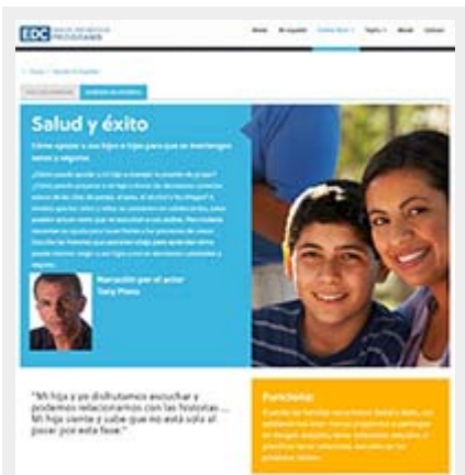
Salud y éxito program from the EDC Health Promotion Programs website

orientations, who were often the targets of controversial rhetoric and proposed policies and, thus, theorized to be more acutely experiencing threats from the election's tenor. Results showed significant elevations in self-reported anxiety and depression but not drinking from the pre-test period (August-October 2016) compared to the post-test period (December 2016-February 2017) among minority populations compared to White and straight Americans.